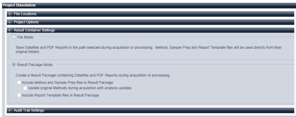
Figure 4. Result package settings.

brought back and all necessary files are ready to recreate the original data and results. This result package also allows a new Master Method workflow where the acquisition method can be protected from changes by users while still giving them the necessary permissions to make changes to the working method needed to review and reprocess data.